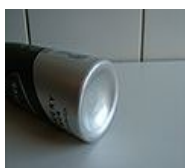
Aerosol spray can