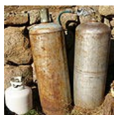
Propane pressure vessel

Pressure vessels can theoretically be almost any shape, but shapes made of sections of spheres, cylinders, and cones are usually employed. A common design is a cylinder with end caps called heads.